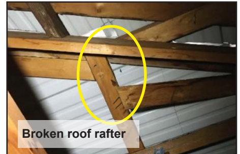
Broken roof rafter

Members requiring a face-to-face visit with Federated staff, should call or e-mail to request an appointment time 24 hours in advance. Line crews will still work from their Jackson and Welcome warehouses. ☎