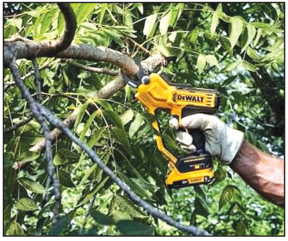
Cut the time it takes for pruning with an electric pruning shears this spring. You'll also cut your aches and pains, thanks to this rechargeable electric power tool.

If your battery tools are powered by another brand, explore if they have a battery-powered pruning shears so you can work smarter and not harder. The DeWalt model is available from Home Depot, Amazon and Ace Hardware.